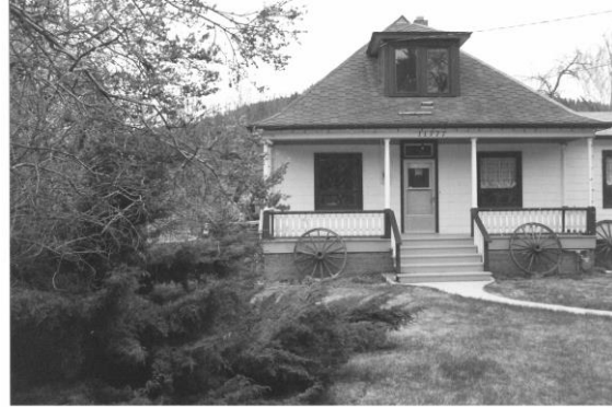
R.B. Angus's orchard home. Co-founder of the Canadian Pacific Railway, National President of Bank of Montreal