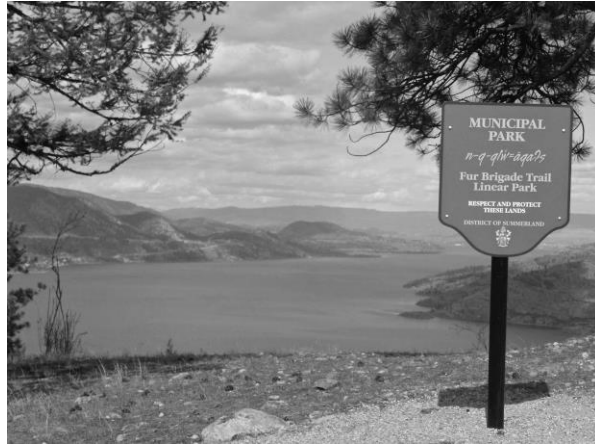
Okanagan Fur Brigade Trail Linear Park One of two parks created for Summerland's Centennial in 2006